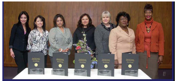
1st Graduating Class of TTUHSC "Promotoras de Salud", along with two instructors